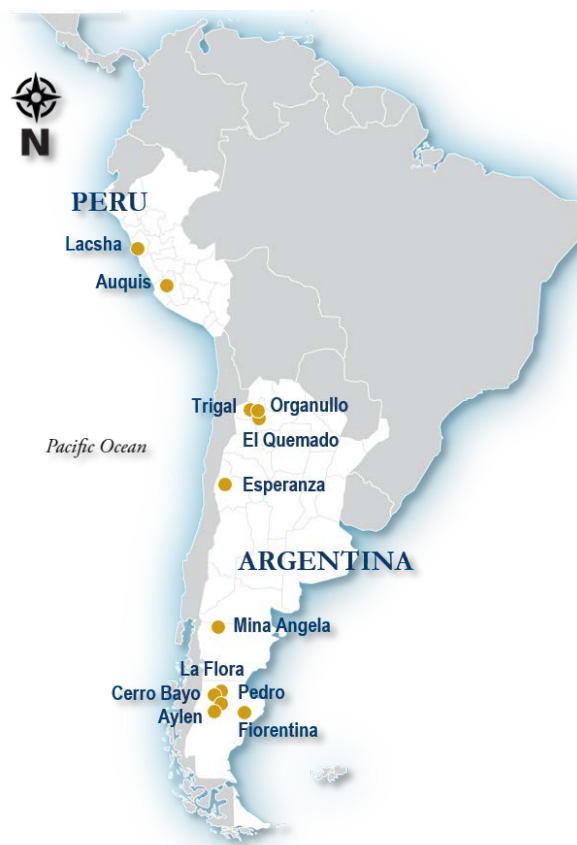
Figure 3: Latin Metals' Exploration Property Portfolio

The Company also announced that it has granted 70,000 common share stock options (each an "Option") to various employees and consultants of the Company and its affiliates. The Options entitle the holder to purchase shares at a price of $0.14 per share for a period of 36 months from the issue date.